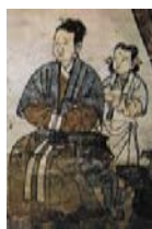
Figure 3. The Female Tomb Owners and Her Maid in Yuanbaoshan Yuan Tomb, Chifeng

(According to current materials, the picture shows the typical image of women and maids in Yuan Dynasty; pictures are taken from Chun-song Xiang's article, Yuanbaoshan Yuan Mural Tomb in Chifeng City, Inner Mongolia, which is published in the fourth volume of Cultural Relics, 1983.)